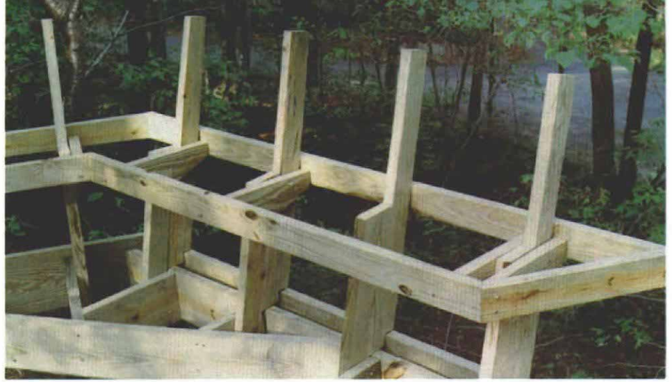
Bench supports built from 2x8s can be trimmed to a width of about 3\frac{1}{2} in. where they form the backrest. The supports should be securely nailed or bolted to the decks supporting structure.

the rest of the structure. Never butt the ends of two decking members together and nail into a single joist. This is one of the major causes of decking failure (top photo, next page). The reason is that water collects in the seam between the butting boards and enters their end grain. And when two boards butt over a single joist, the problem is intensified. With only \frac{3}{4} in. for each deck board to be nailed into, the nails must be placed very close to the end of the board, encouraging splitting. We get around these problems by doubling up strategic joists, using a block of wood between them to create a 1\frac{1}{2} -in. space. The end of each deck board cantilevers over this space so water can't collect. This also allows the boards to be nailed farther from their ends, which minimizes splitting. If